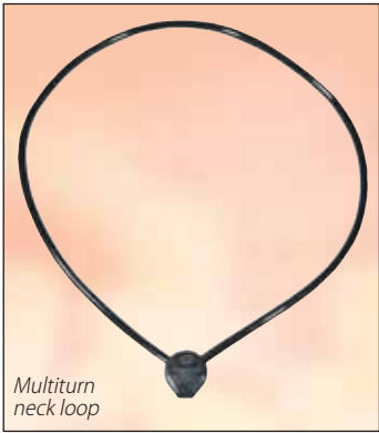
Multiturn neck loop