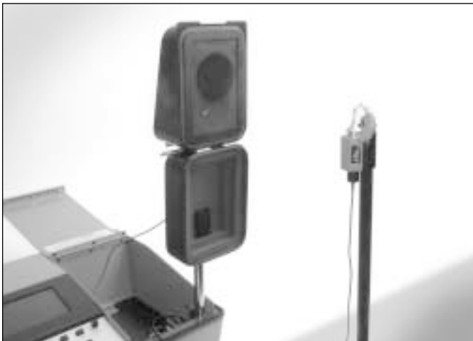
Figure 5—Forward Measurement