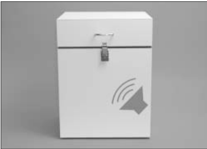
Figure 1—Sound chamber with speaker mount

The speaker in our large sound chambers are positioned on the right side of the chamber at a 45° angle, as illustrated in Figure 1. It is important to keep this in mind when positioning the directional aid for measurements.