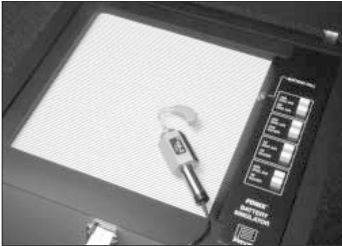
Figure 3A—Reverse measurement in 6050 sound chamber