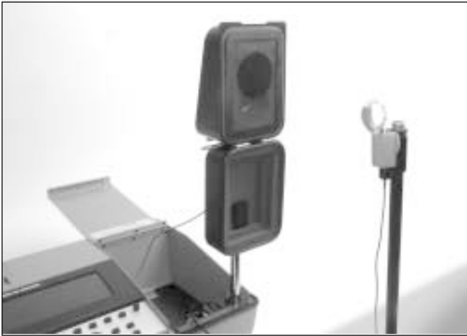
Figure 6—Reverse measurement

possible. If you have a quiet testing environment, use 50 dB SPL. Noisier testing environments may require you to use a higher source level to get a good measurement.