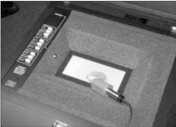
Figure 3B—Reverse measurement in 6020 sound chamber