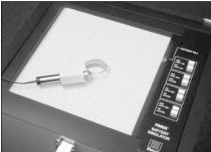
Figure 2A—Forward position of the 6050 sound chamber