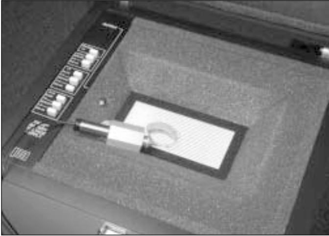
Figure 2B—Forward position of the 6020 sound chamber