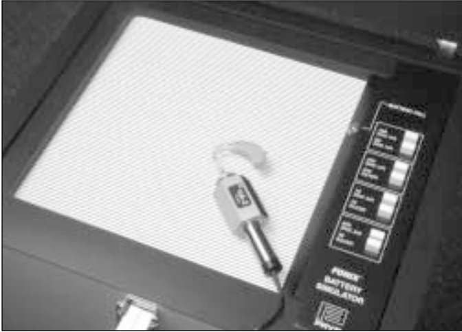
Figure 3A—Reverse measurement in 6050 sound chamber