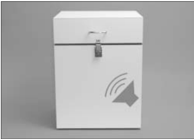
Figure 1—Sound chamber with speaker mount

The speaker in our large sound chambers are positioned on the right side of the chamber at a 45° angle, as illustrated in Figure 1. It is important to keep this in mind when positioning the directional aid for measurements.