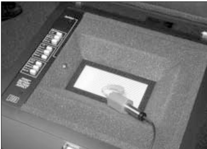
Figure 3B—Reverse measurement in 6020 sound chamber