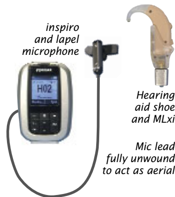
inspiro and lapel microphone