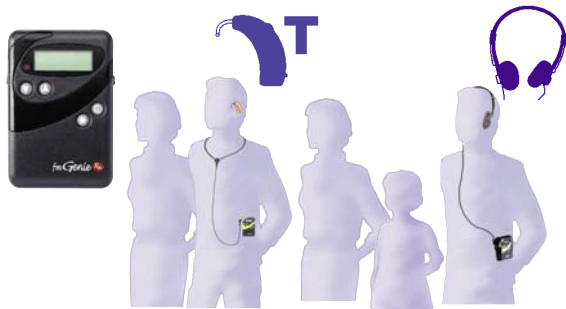
Neckloop for use with hearing aid on 'T' setting

The speaker wears the radio microphone transmitter to pick up their voice.