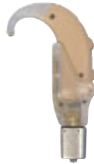
Hearing aid shoe and MLxi