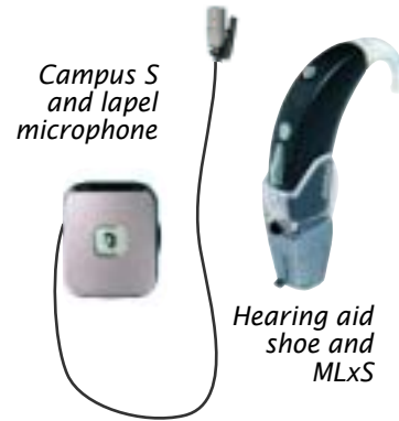
Hearing aid shoe and MLxS