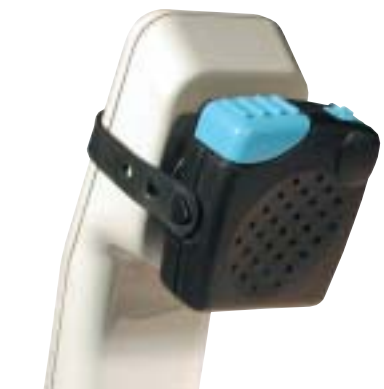
Adjustable strap slips over earpiece of telephone handset