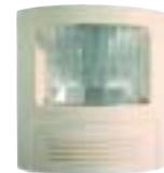
Replacement Alkaline PP3 battery Connevans part no: MBNPP3X1