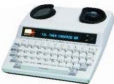
MINICOM 6000 Connevans part no: 40TM6000