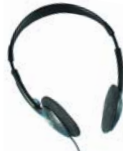
Silent headphones Connevans part no: 95SILHS1