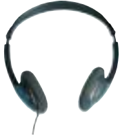
Headphones Connevans part no: .S20HEAD1