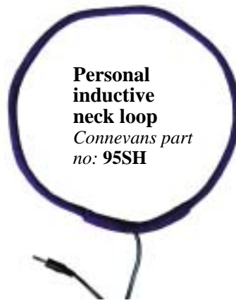
Personal inductive neck loop Connevans part no: 95SH