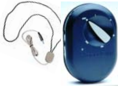
Crescendo 20 Plus system with inductive neck loop Connevans part no: .S20/5