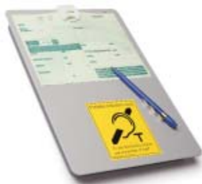
The highly portable Clipboard InfoLoop™ features sophisticated electronic circuitry to ensure the best possible voice reproduction. Automatic standby mode conserves battery life

The Power Supply Unit connects to any convenient mains outlet to re-charge the Clipboard InfoLoop™.