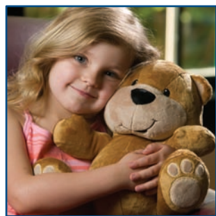
a cuddly companion for any toddler

The Sound Oasis Sleep Bear delivers advanced sound therapy for superior calming of infants and young children.